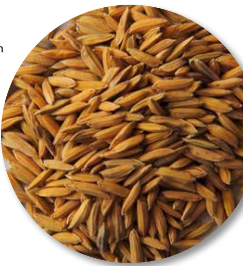
COLD-TOLERANT rice variety nominated as ARICA10 by Africa Rice Breeding Task Force.

These environmental stresses covered by the STRASA project have a significant impact on the productivity of rice farms and farmers' income. Drought, for example, is a major problem in rice-growing areas of Africa that are predominantly rainfed. Rice yield losses attributed to iron toxicity range from 10 to 100%, with an estimated average of 50%. A survey